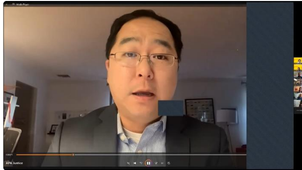
2024/11/18 APA Justice Monthly Meeting

On December 8, 2024, Senator-elect Andy Kim was appointed to the United States Senate by Governor Phil Murphy , allowing him to assume office ahead of his elected term beginning on January 3, 2025. The appointment followed Kim's certification by the Board of State Canvassers as the winner of the Senate race to succeed Bob Menendez . Kim was sworn in on Monday, December 9, 2024, becoming New Jersey's newest senator.