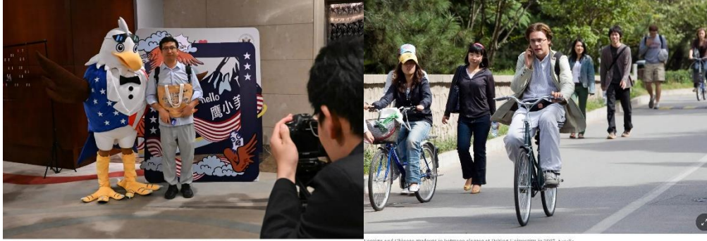
At a college fair in Beijing organized by the American Embassy.