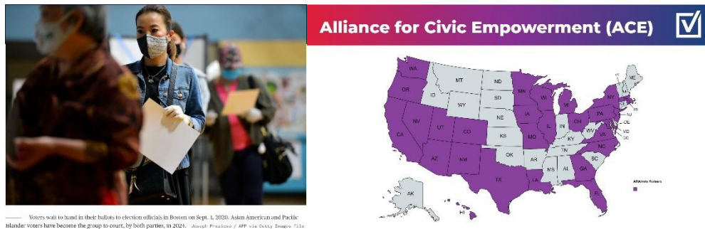
— Voters wait to hand in their ballots to election officials in Boston on Sept. 1, 2020. Asian American and Pacific Islander voters have become the group to court, by both parties, in 2024.

A major message from the 60th Anniversary of March on Washington is voter registration and turnout. The 1963 March on Washington was a catalyst for landmark voting rights action, leading to the Voting Rights Act of 1965. Advocates are sounding alarms about voter suppression and the rollback of voting rights protections, particularly those affecting Black and minority voters.