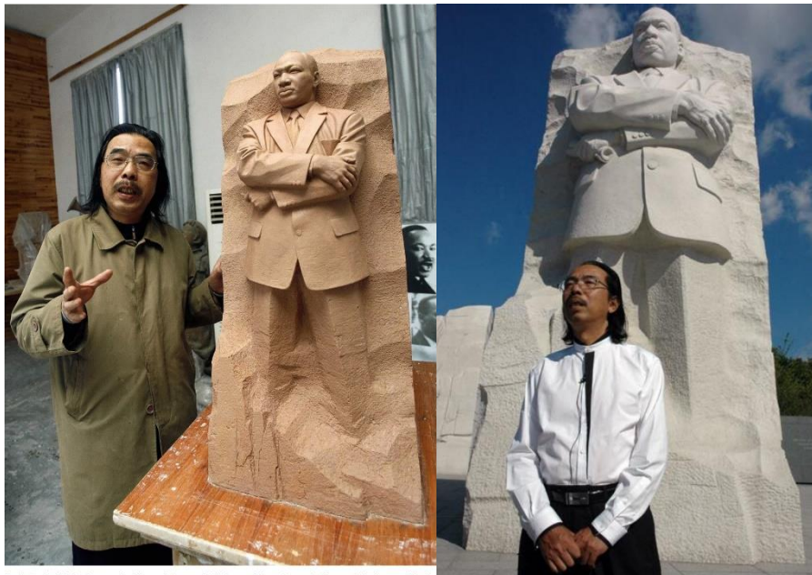
Sculptor Lei Yixin, known for his sculptures of Chairman Mao, showed off a model of a new Martin Luther King Jr. statue at his studio in China in 2007. The three-story full size sculpture is stranded in China because of the Greek debt crisis.