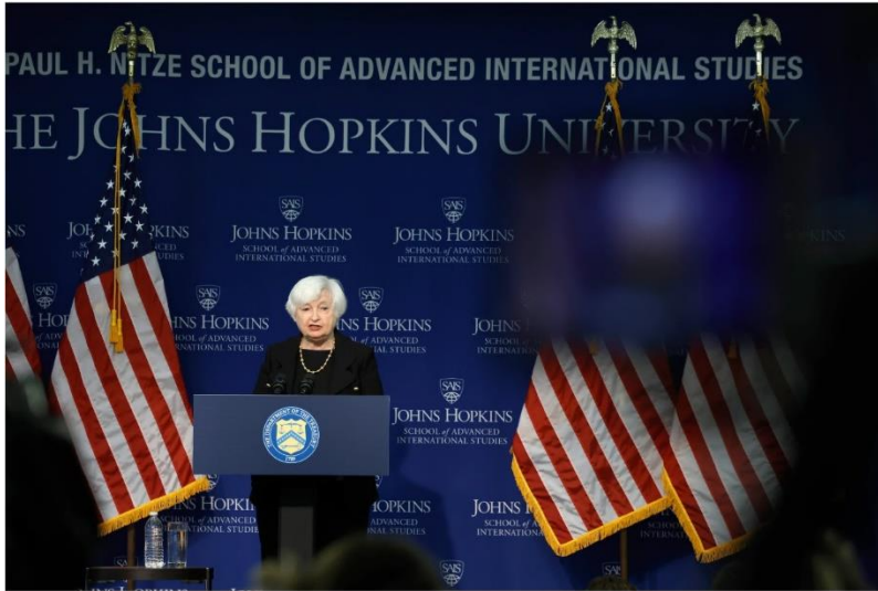
Secretary of the Treasury Janet Yellen delivers remarks at Johns Hopkins University's School of Advanced International Studies (SAIS) on April 20, 2023 in Washington.